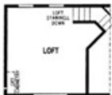
LOFT STORAGE AREA