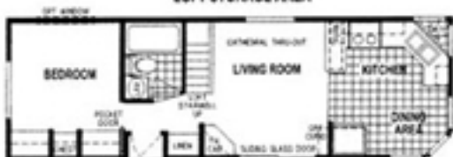
1926CTL/35" 1BEDROOM - CATHEDRAL THRU-OUT

YOUR SKYLINE DEALER IS: Toutle River RV Resort, Inc. 150 Happy Trails Castle Rock, WA 98611 360-274-8373 www.greatrvresort@aol.com greatrvresort@aol.com