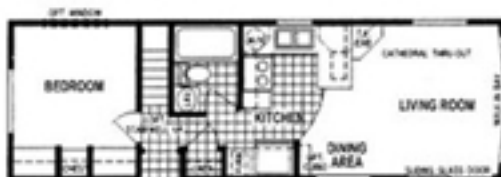
1931CT/34'-5" 1BEDROOM - LOFT - CATHEDRAL THRU-OUT