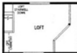
LOFT STORAGE AREA