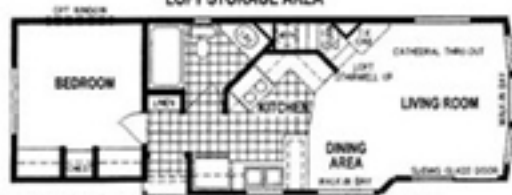
1930CT/33'-10" 1BEDROOM - LOFT - CATHEDRAL THRU-OUT