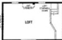
LOFT STORAGE AREA